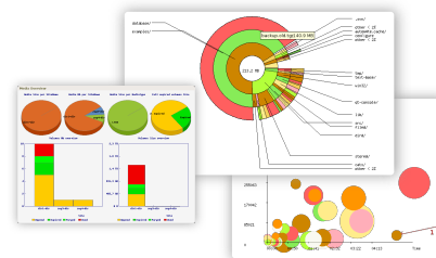
Report, analyze and manage

In addition, the Administrator will now benefit from an online help mode that will display automatic text suggestions when searching data types.